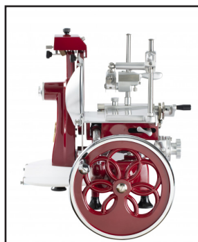
Rose Flower Wheel Design